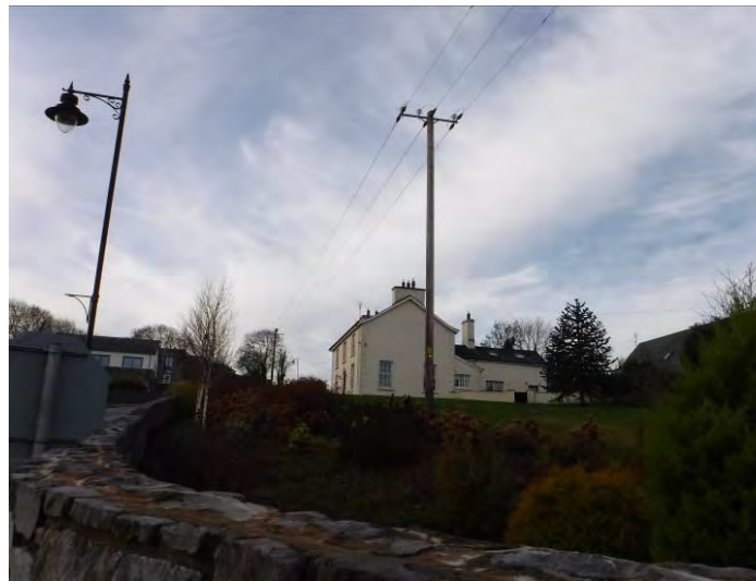
Plate 13.62 – CH 39, facing southwest