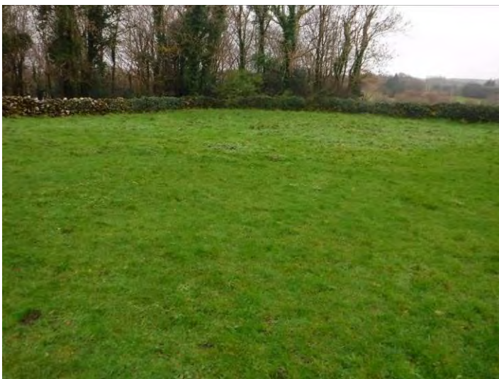
Plate 13.73 – CH 46, facing south