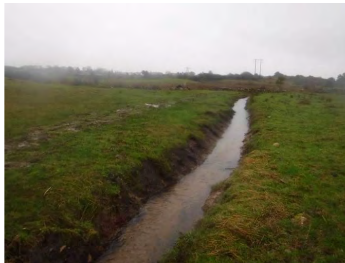
Plate 13.26 - Machine straightened watercourse feeding Bearna Stream (AAP 3), facing southeast