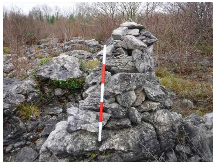
Plate 13.76 - Modern clearance cairn of stones, facing south