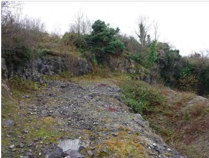
Plate 13.89 - AH 27, facing southwest