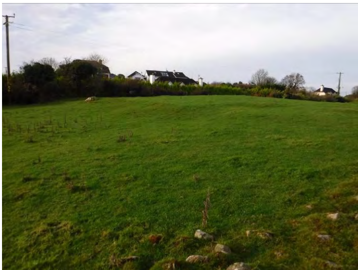
Plate 13.95 - Raised rectangular platform (CH 38), facing west