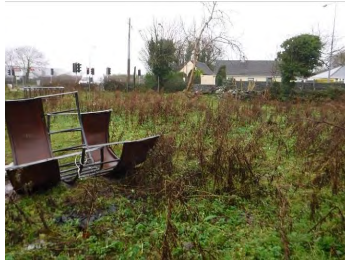
Plate 13.92 – CH 58, facing north