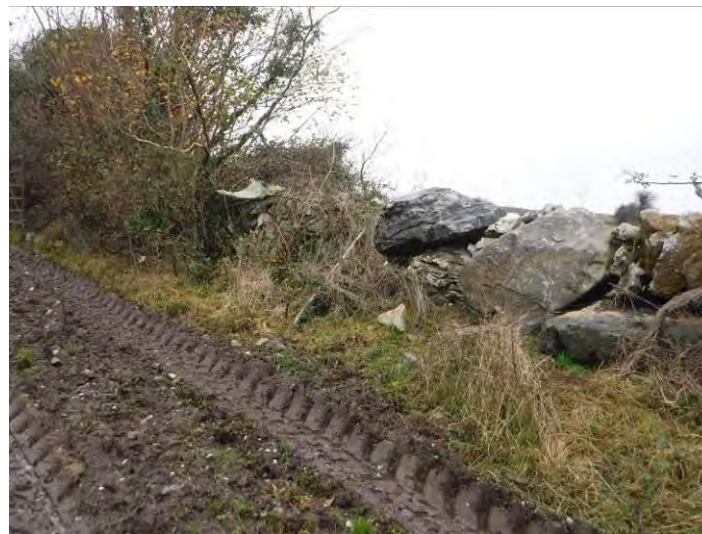
Plate 13.80 - TB 22 in 7603, facing west