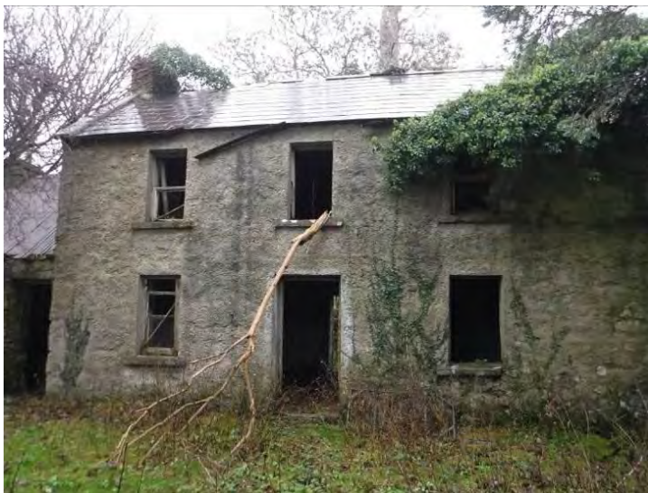
Plate 13.31 – CH 23 immediately west of proposed N6 GCRR, facing north