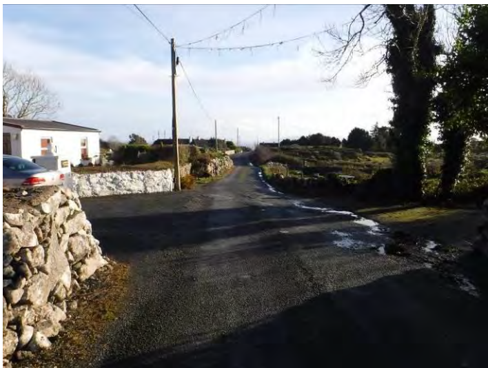
Plate 13.11 - TB 4, facing southeast