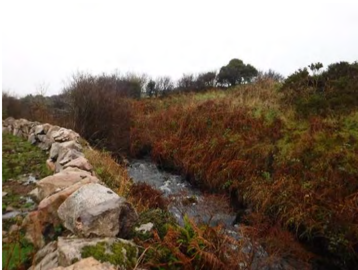
Plate 13.25 - TB 10 and AAP 3 (including traditional dry stone wall), facing north