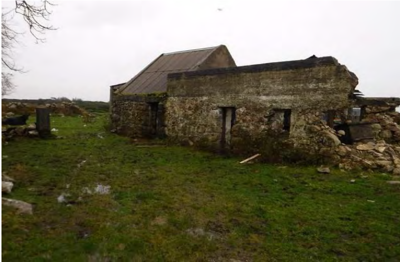
Plate 13.39 – CH 26, Ruined vernacular dwelling, facing east