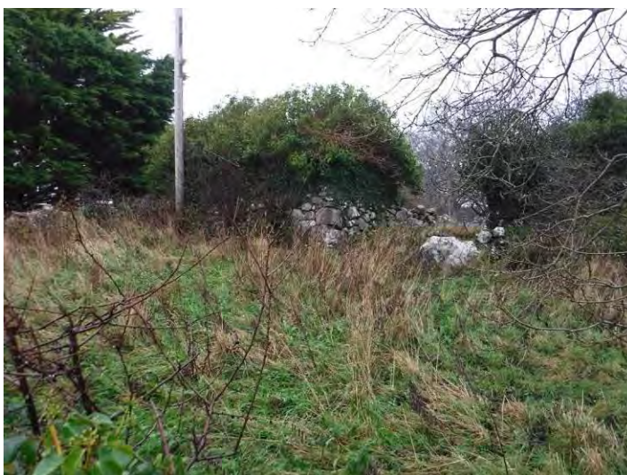
Plate 13.29 – CH 22, facing northeast