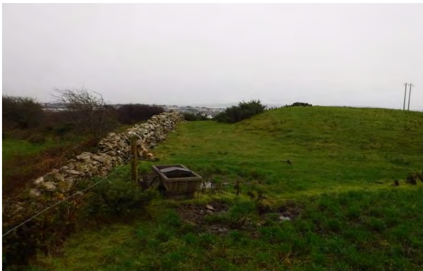
Plate 13.47 - TB 15 (including traditional dry stone wall), facing southwest