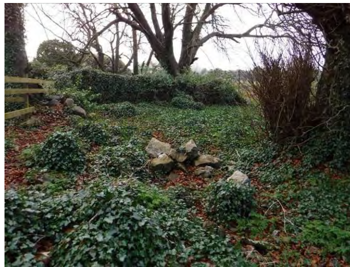
Plate 13.68 - AH 14, facing north