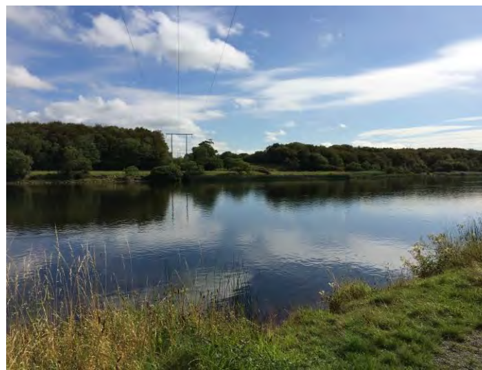
Plate 13.70 – River Corrib crossing (AAP 8), facing northeast