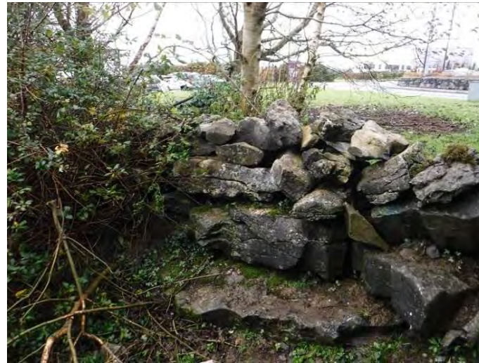
Plate 13.88 - TB 29 (including traditional dry stone wall), facing northeast