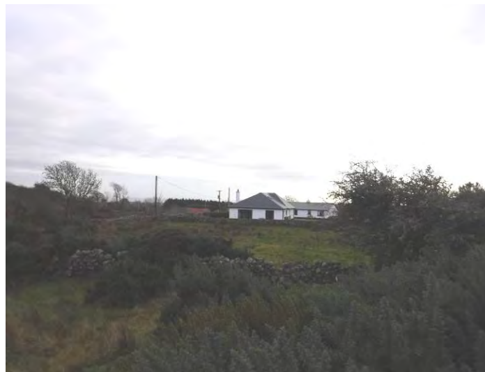
Plate 13.56 - TB 18, facing east