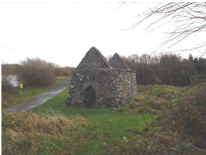
Plate 13.69 - AH 15/BH 9, facing east