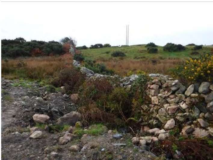
Plate 13.61 - TB 21 (including traditional dry stone wall), facing west