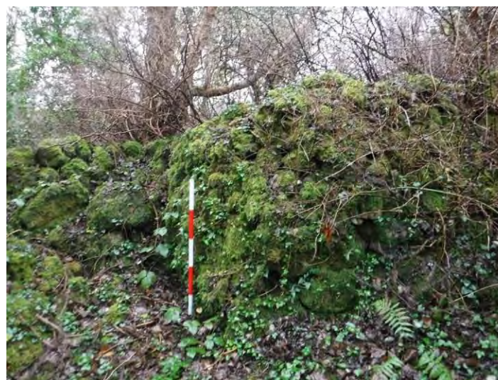
Plate 13.30 – CH 21, facing southwest