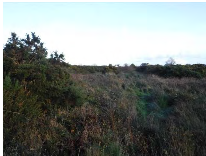
Plate 13.14 - Location of CH 10, facing east