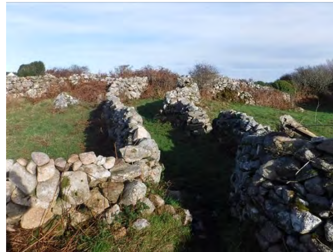
Plate 13.6 – Tradition dry stone walled laneway adjacent to AH 1/CH 4, facing northeast