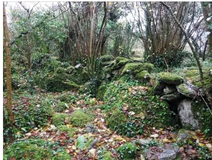
Plate 13.94 - Relict field boundaries in 7553