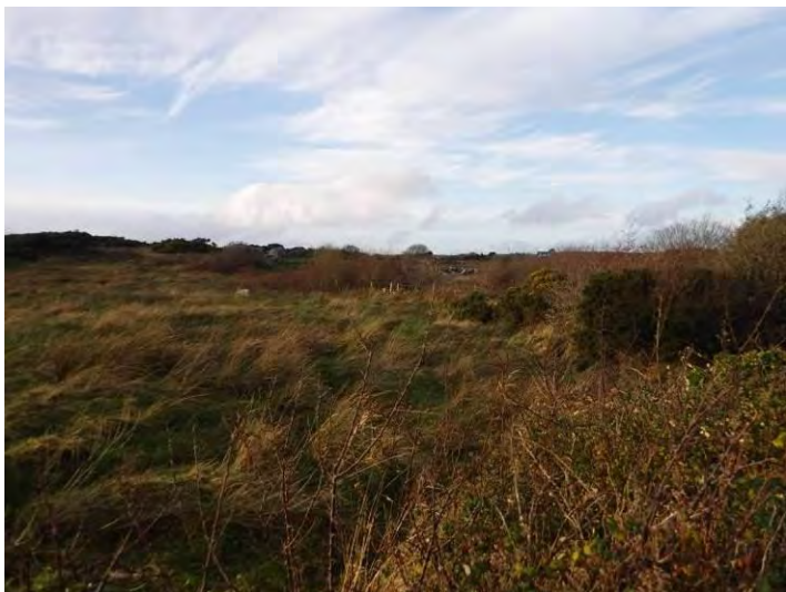
Plate 13.15 - TB 5, facing west