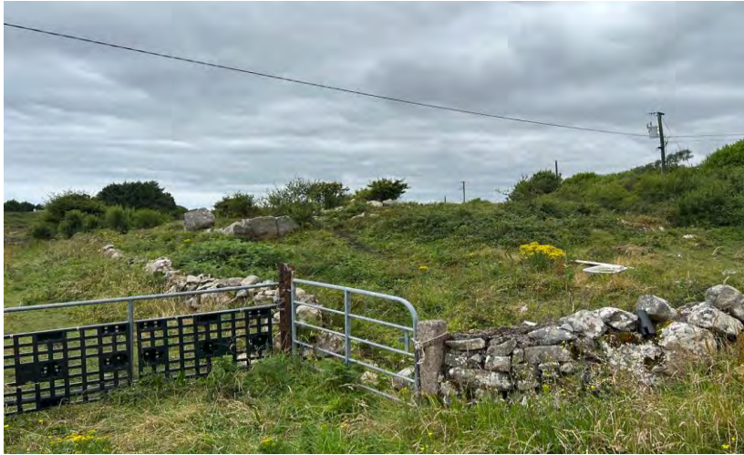
Plate 13.111 – Site of AH 42, facing west