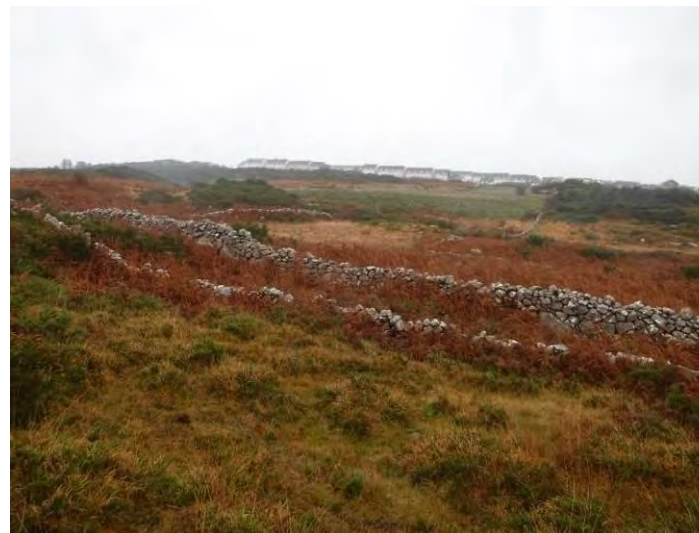
Plate 13.32 - TB 11, traditional dry stone walled laneway, facing northeast