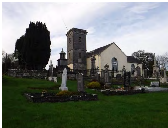
Plate 13.98 - BH 7, facing southwest