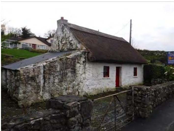
Plate 13.63 - BH 4, facing west