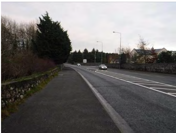
Plate 13.57 - TB 19, facing southeast