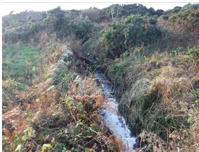
Plate 13.18 - TB 6, facing southeast