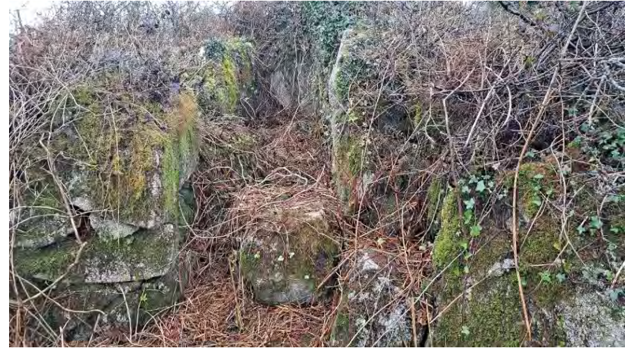
Plate 13.112 – Detail of AH 42, facing north