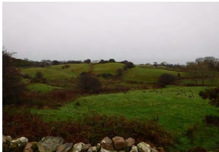
Plate 13.48 - Location of AH 1 and AAP 5, facing northeast