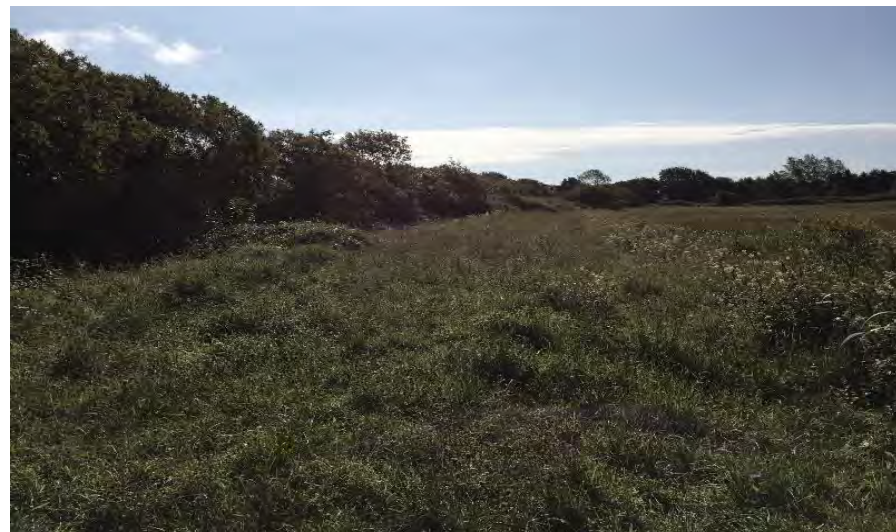
Plate 13.106 – Remains of railway bed (CH 68), facing southeast