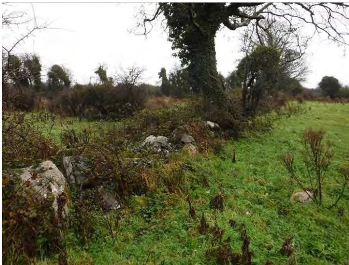
Plate 13.93 - TB 41 (including traditional dry stone wall), facing north