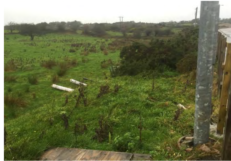
Plate 13.110 - Path of the southern section of the proposed N6 GCRR, facing north