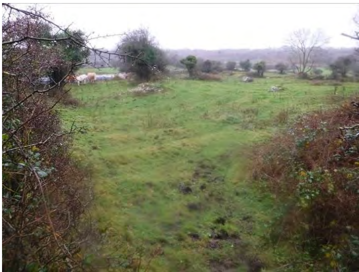
Plate 13.27 - 'Lazy Beds' facing south in 7067