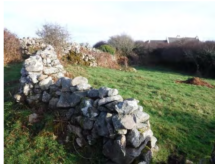
Plate 13.4 - AH 1/CH 4, traditional dry stone wall enclosure facing northeast