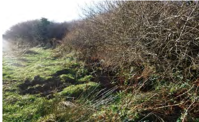
Plate 13.8 - TB 2/AAP 1, facing southwest along watercourse