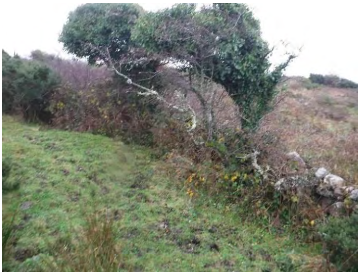
Plate 13.21 - TB 7, traditional dry stone wall, facing southeast