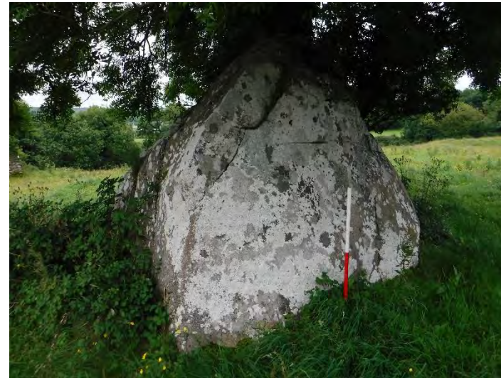
Plate 13.102 - Possible mass rock (CH 69), facing southeast