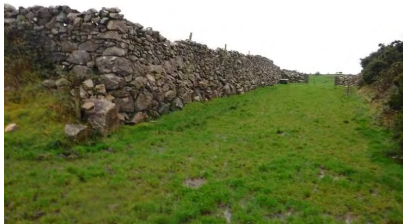
Plate 13.44 - Hollow trackway lined with traditional dry stone walls (CH 71), facing southwest