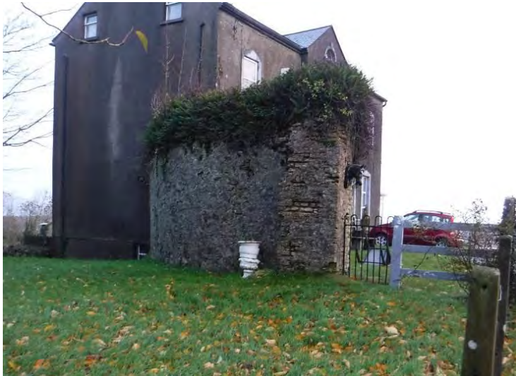
Plate 13.101 - Section of enclosing wall at BH 5, facing north