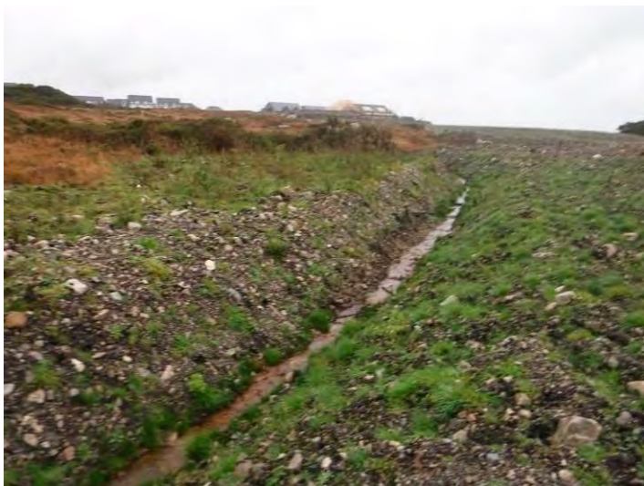
Plate 13.35 - Disturbed area and straightened watercourse, facing east