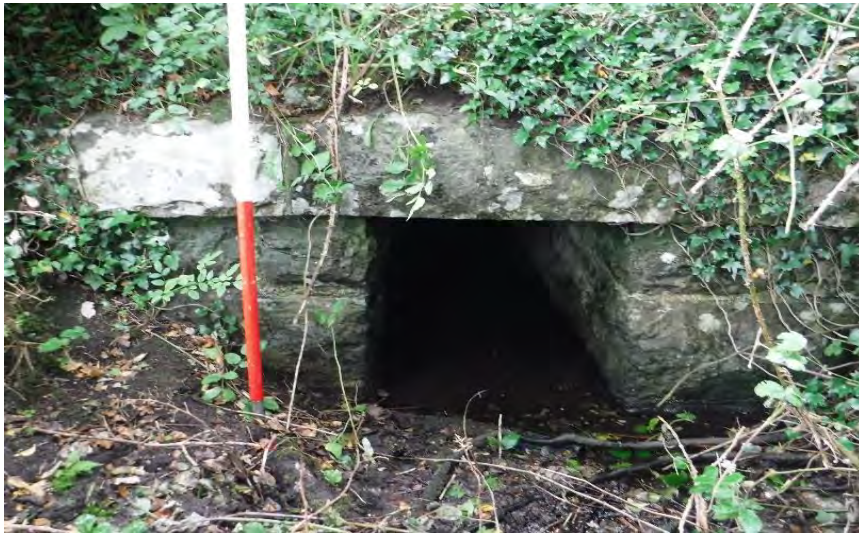
Plate 13.107 – Railway culvert (CH 70), facing north-northeast