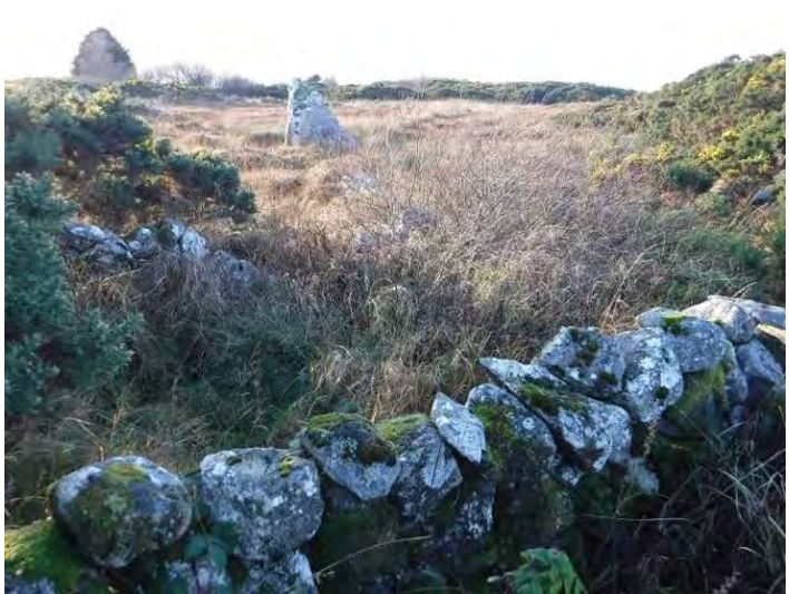
Plate 13.13 – Traditional dry stone walled laneway in 7757, facing east