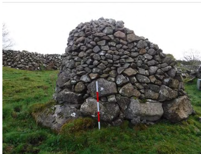
Plate 13.58 – CH 37, dry stone constructed clearance cairn, facing east