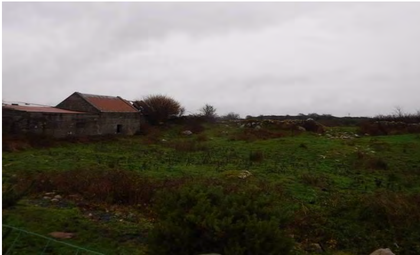
Plate 13.41 - TB 13, facing east