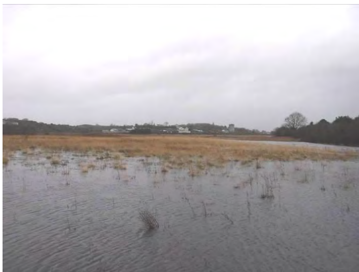
Plate 13.81 - View northwest across AAP 10 towards AH 21