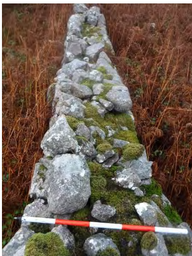
Plate 13.33 - TB 11 showing construction of traditional dry stone granite wall