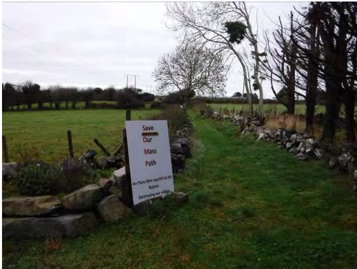
Plate 13.91 – CH 57, facing northeast