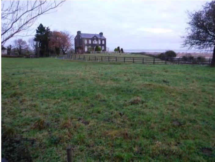
Plate 13.99 - BH 5, facing northwest