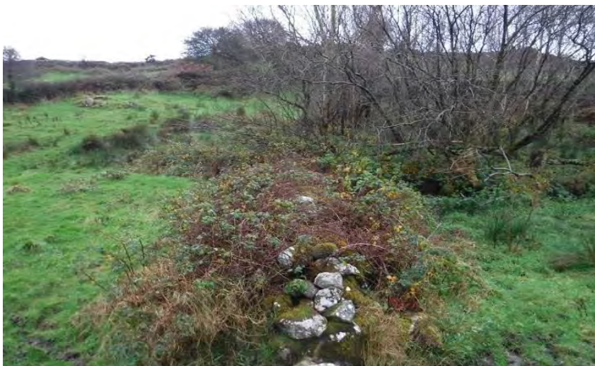
Plate 13.49 - AH 1, purported location of Bullaun Stone, facing south