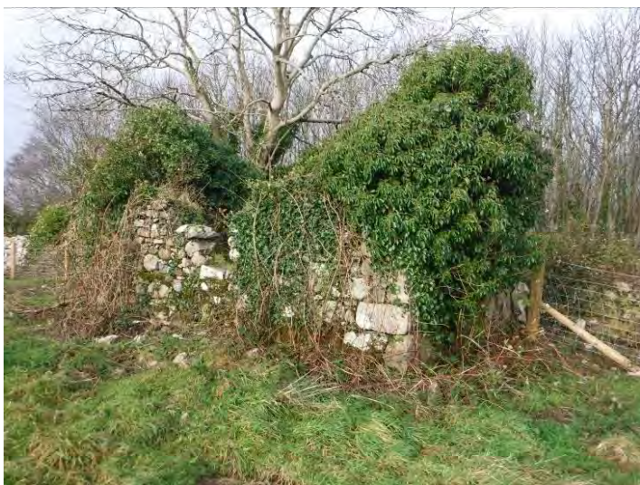
Plate 13.65 - CH 42, facing north