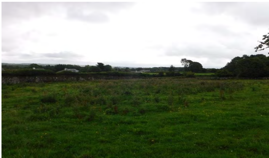
Plate 13.103 – Interior of walled garden, facing east