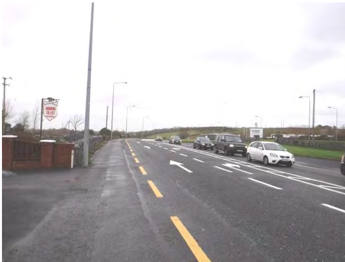
Plate 13.85 - TB 26, facing northeast