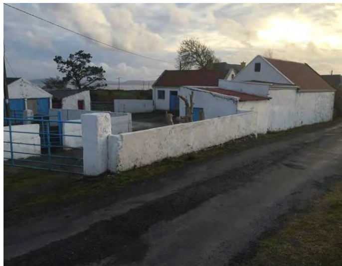
Plate 13.16 – CH 13, facing east