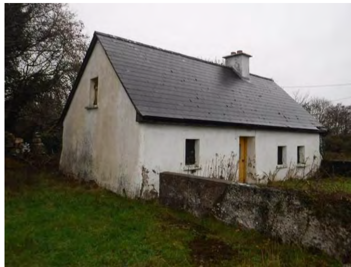
Plate 13.22 – CH 18, facing northeast