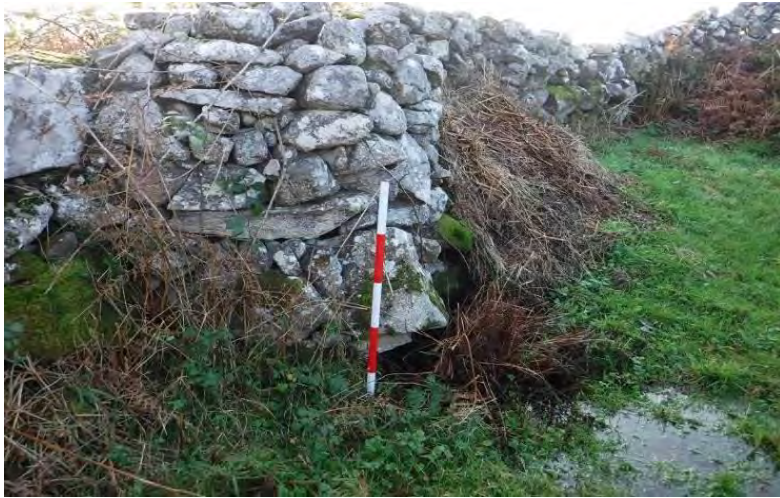
Plate 13.7 – Spring or well, facing south