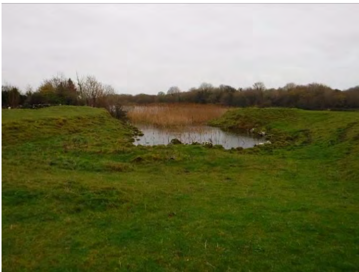
Plate 13.71 - Inlet from the River Corrib (CH 45), facing south