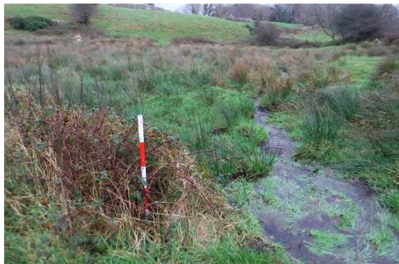
Plate 13.50 – AAP 5, facing north