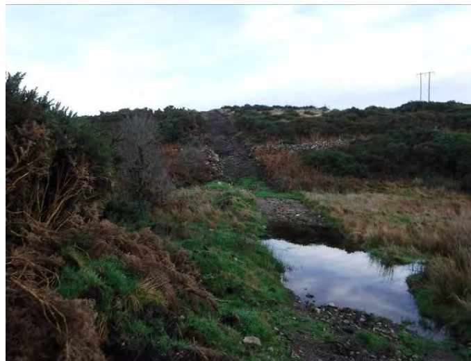
Plate 13.60 – Undulating marginal land within AAP 8, facing northeast