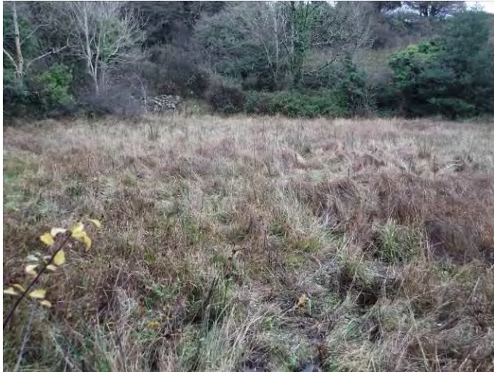
Plate 13.83 - Bottom of 'Pollinapreaghaun' AH 24/AAP 11, facing southeast