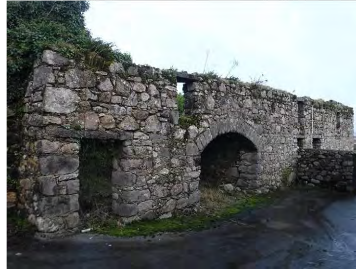
Plate 13.100 - Outbuildings to rear of BH 5, facing northwest