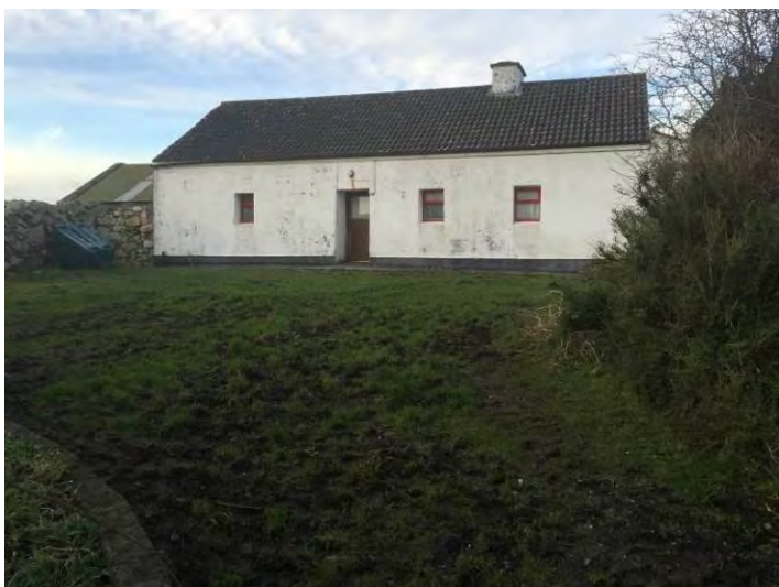
Plate 13.17 – CH 11, facing north