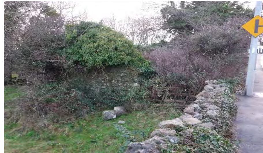
Plate 13.108 – CH 63, facing east