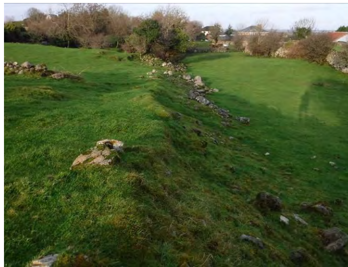
Plate 13.96 - Grassed over field boundary (CH 38) facing northwest