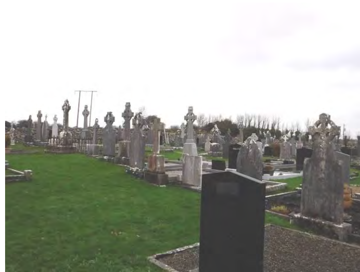
Plate 13.86 - AH 26, facing north