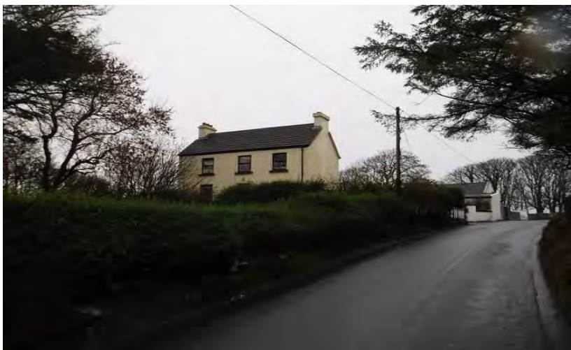
Plate 13.45 - View north towards CH 30