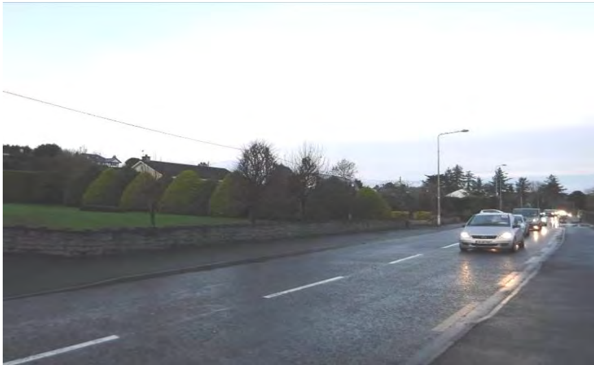
Plate 13.109 - TB 20, facing west-northwest