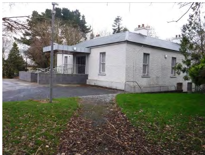
Plate 13.66 - CH 41, facing south