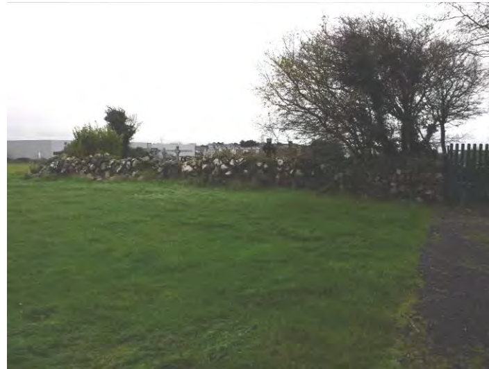
Plate 13.90 - AH 29/BH 17, facing west