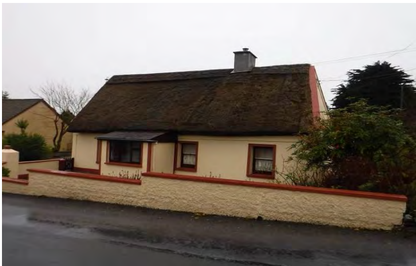
Plate 13.43 - BH 2, facing southeast