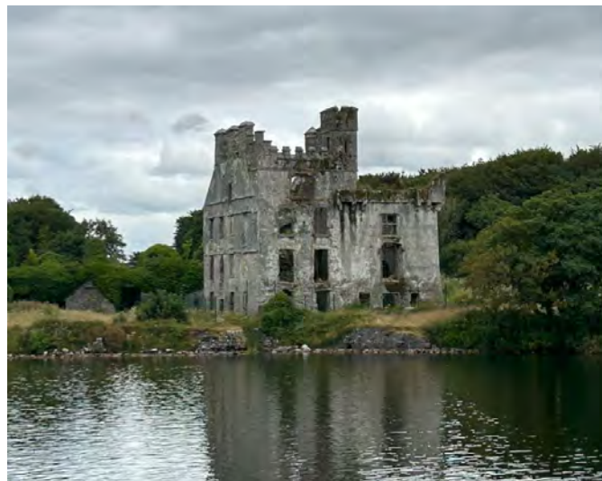
Plate 13.72 - AH 16/BH 10, facing northeast