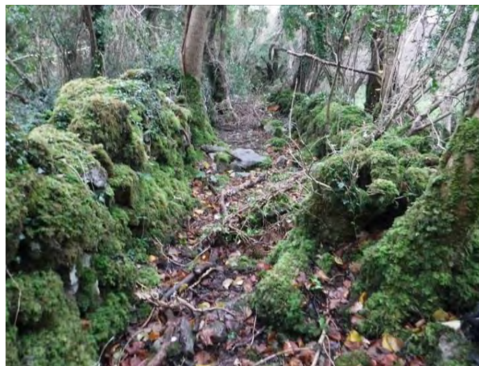
Plate 13.74 – Traditional dry stone walled trackway (CH 72) bounding DL 8, facing northwest