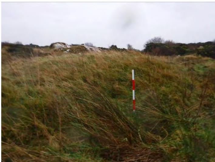
Plate 13.19 - Mound immediately west of stream at AAP 2