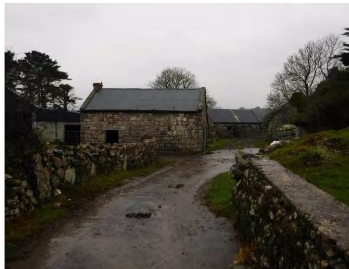
Plate 13.28 – CH 20, facing west