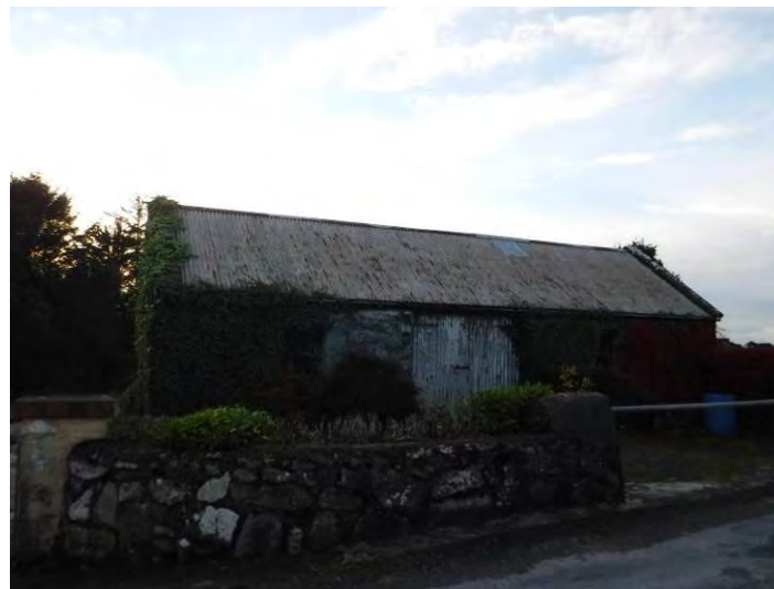
Plate 13.12 – CH 7, facing west