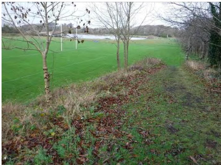
Plate 13.67 - AH 34, facing north