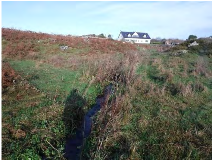
Plate 13.9 - Stream in 7860, facing northeast, facing east