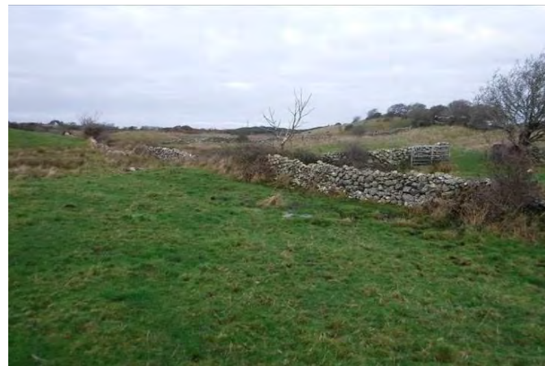
Plate 13.54 - TB 17 (including traditional dry stone wall), facing northwest