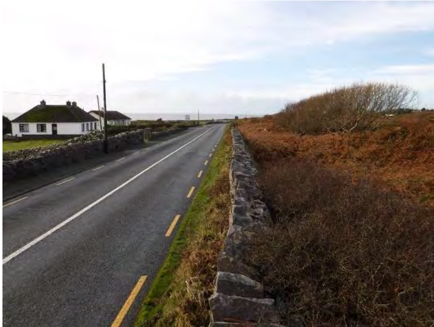
Plate 13.1 - Sea Road (TB 1), facing southwest

The Plates included below are relate to the results detailed in Appendix A.13.6 in Volume 4 of this updated EIAR.