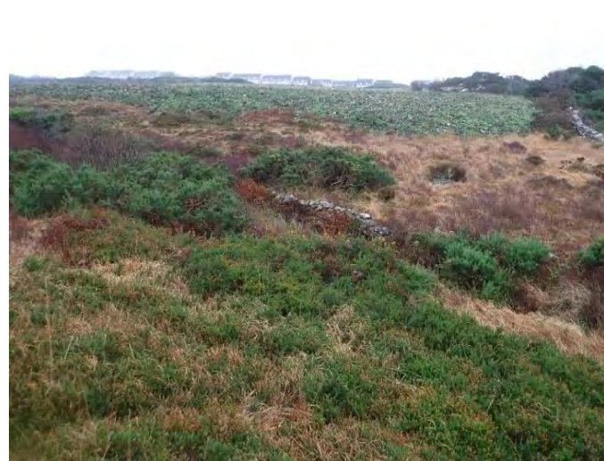
Plate 13.34 - AAP 4, facing northeast