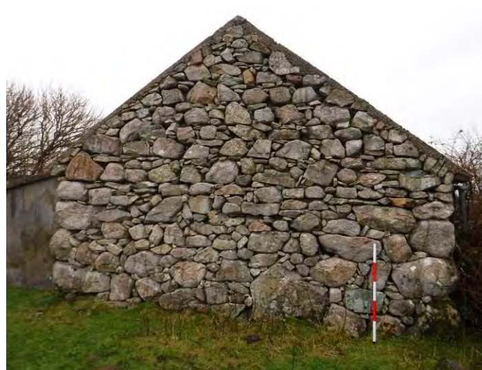
Plate 13.38 – CH 25, stone built shed, facing east