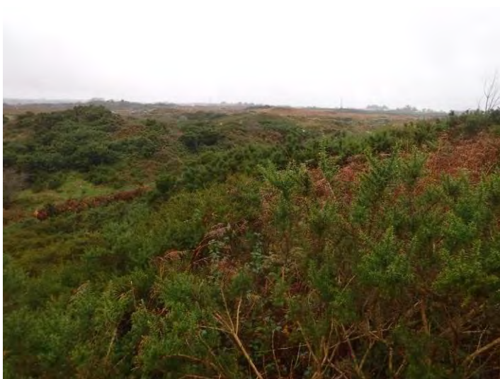
Plate 13.37 - View north towards TB 12