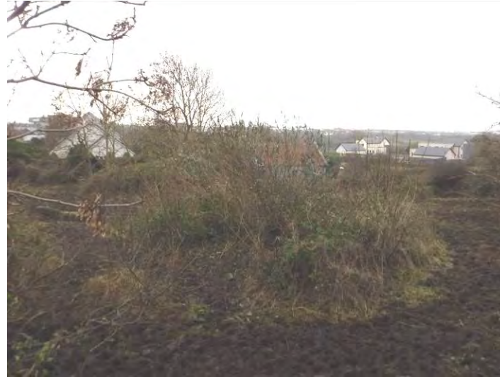
Plate 13.84 – CH 53, facing southwest