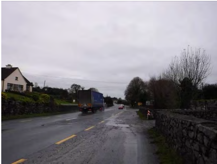
Plate 13.87 - TB 28, facing southwest