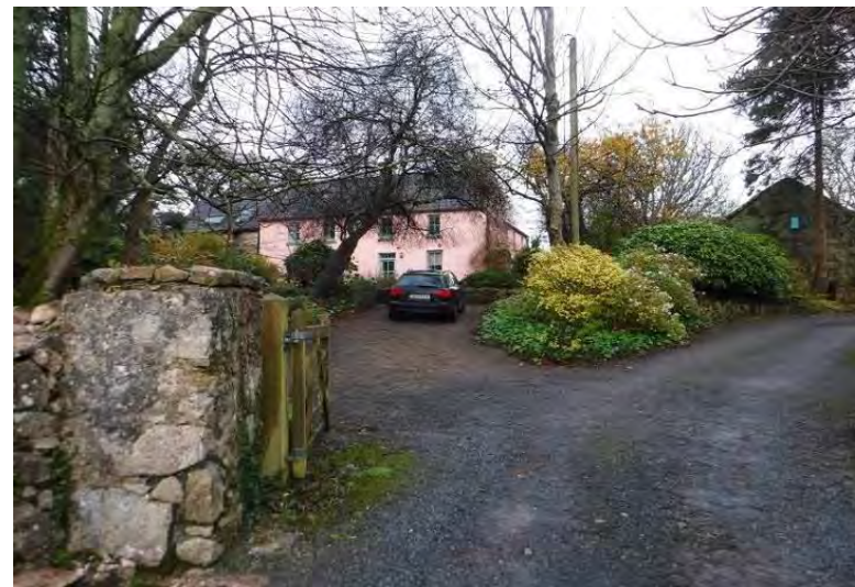
Plate 13.52 – CH 35, Renovated farmhouse and barn, facing northeast