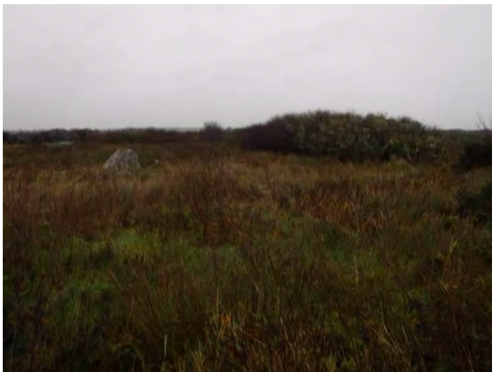
Plate 13.23 - TB 8, levelled boundary, facing north