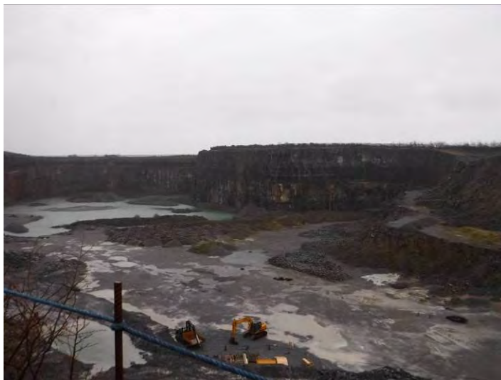
Plate 13.79 - View east across the quarry