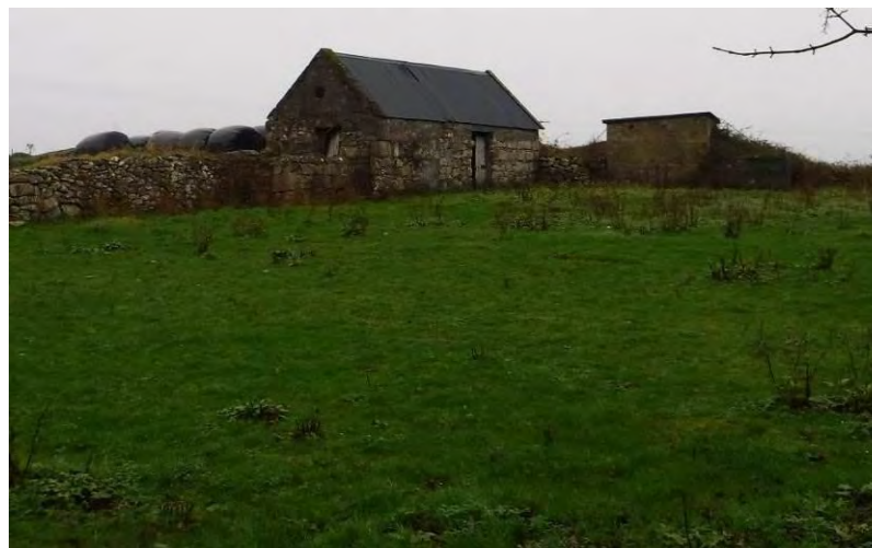
Plate 13.46 - CH 32, facing northeast