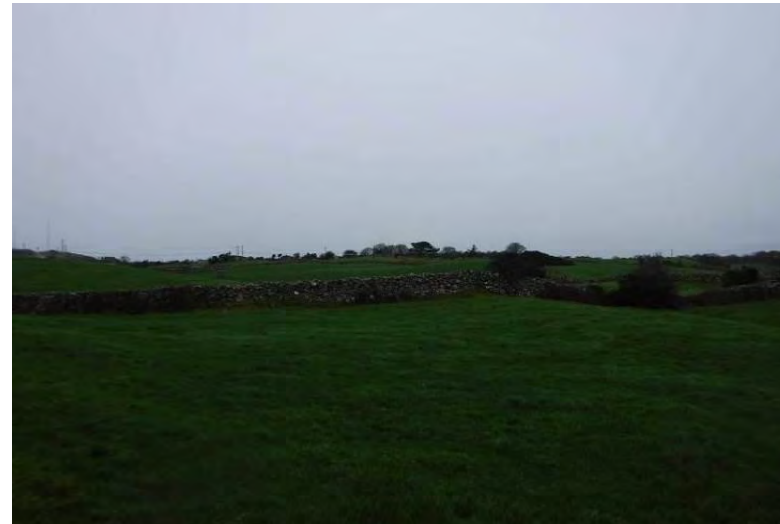
Plate 13.42 - TB 14, facing north