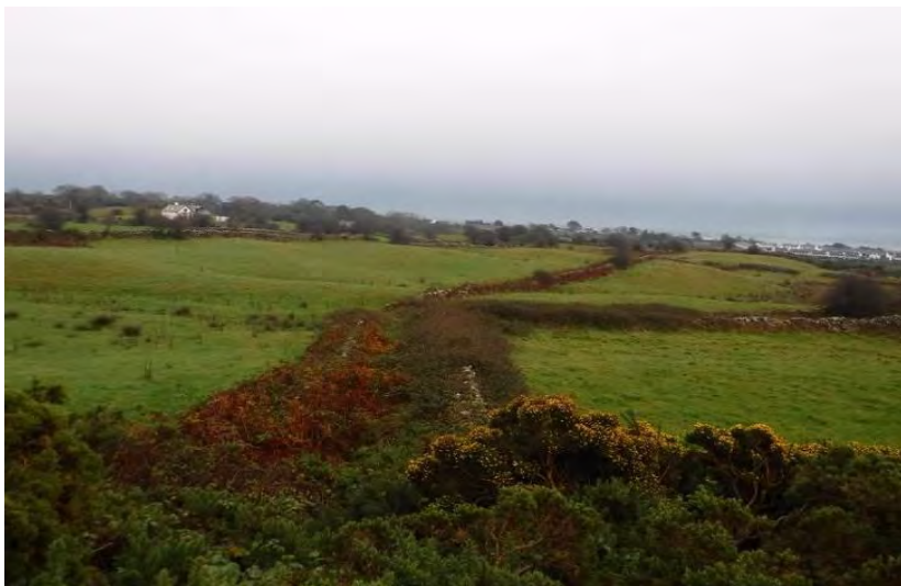
Plate 13.51 - Overgrown walled laneway, associated with CH 33, facing east