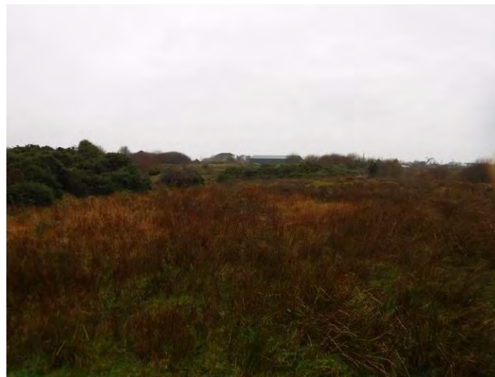
Plate 13.24 - TB 9, stone wall and hedgerow, facing west