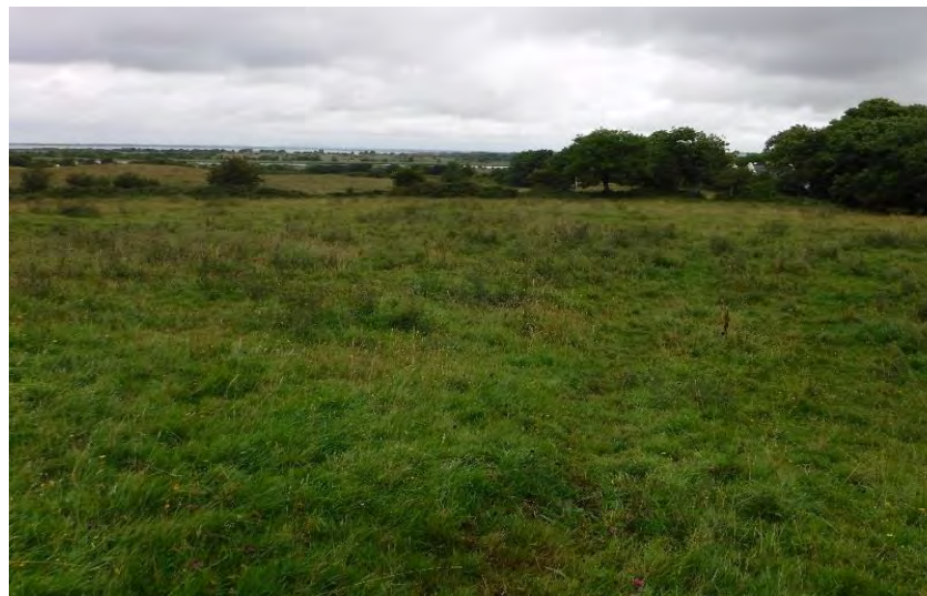
Plate 13.104 – Route of proposed pipeline, facing northeast