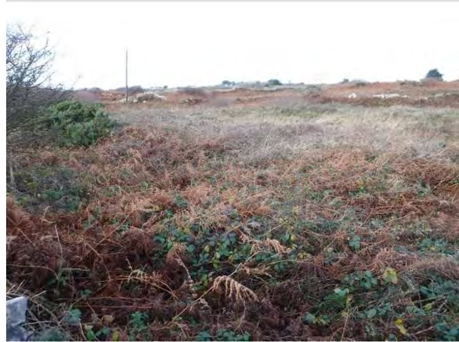
Plate 13.2 - Overgrown fields at southern extent of proposed N6 GCRR, facing northwest