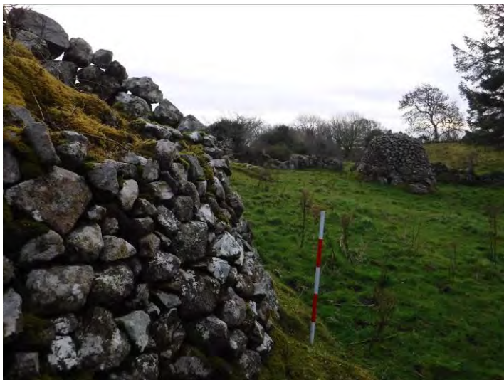
Plate 13.59 – CH 37, dry stone constructed clearance cairn, facing southeast