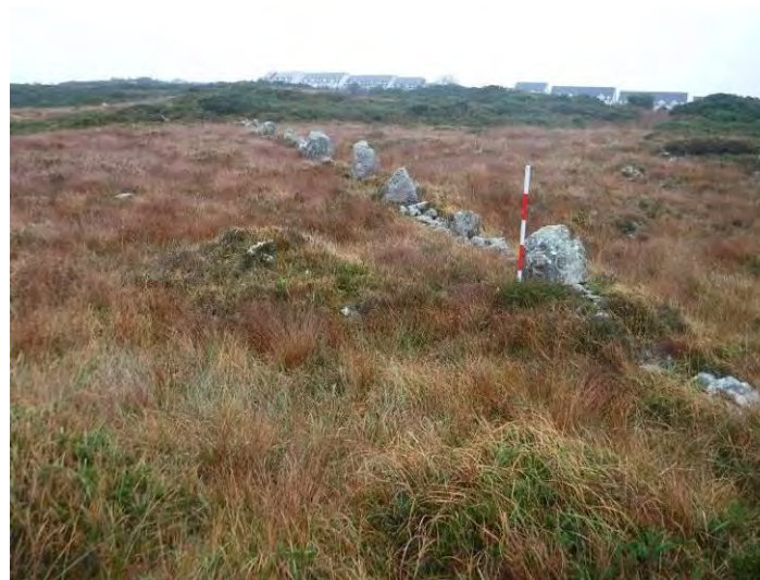
Plate 13.36 - Unfinished dry stone wall, facing northeast