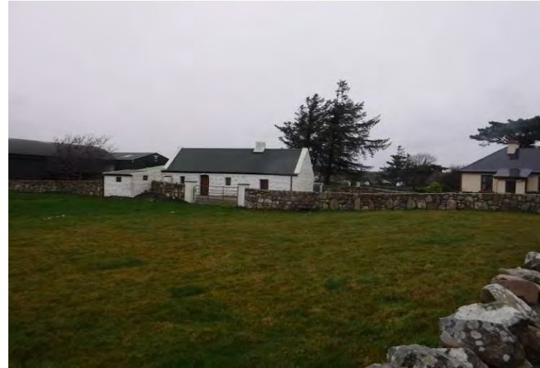
Plate 13.40 – CH 27, vernacular dwelling, facing north