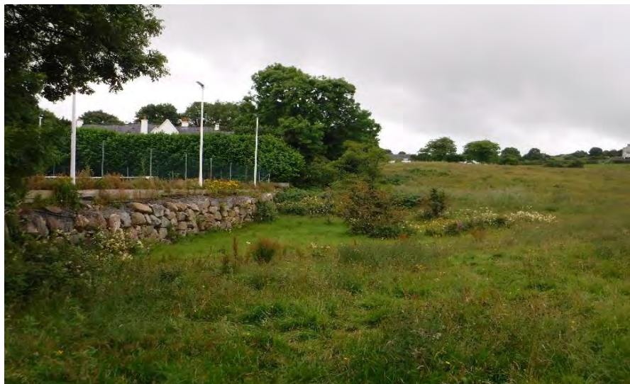
Plate 13.105 – The remains of 'Loughaunnafraska' (AAP 12), facing south-southwest