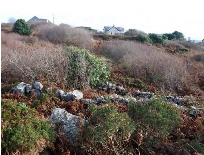
Plate 13.3 - Relict field system, facing northeast