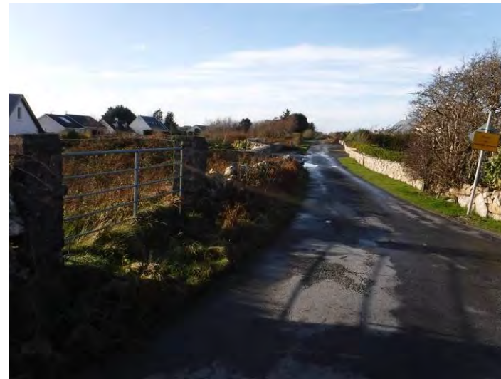
Plate 13.10 - TB 3, facing northwest