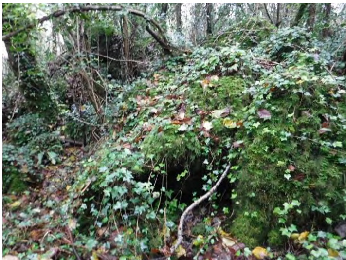
Plate 13.75 – CH 49 in 7104, facing west