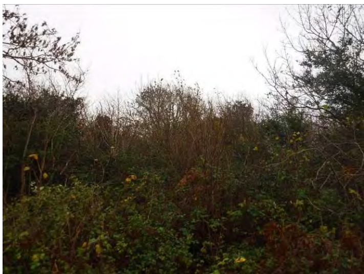
Plate 13.77 - View east towards CH 50