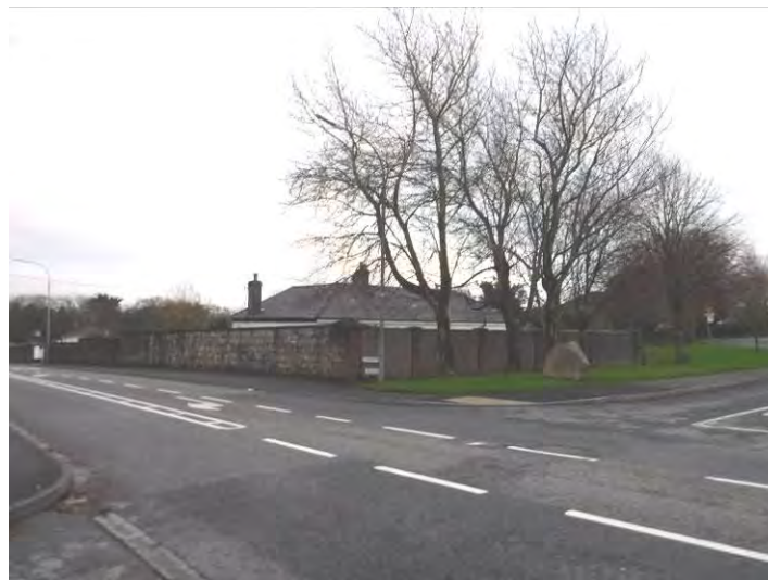
Plate 13.64 - CH 40, facing south