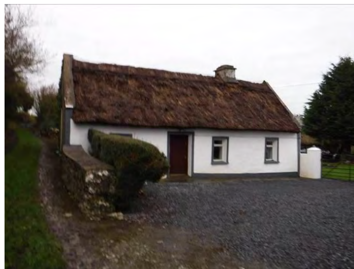
Plate 13.82 - BH 12, facing north