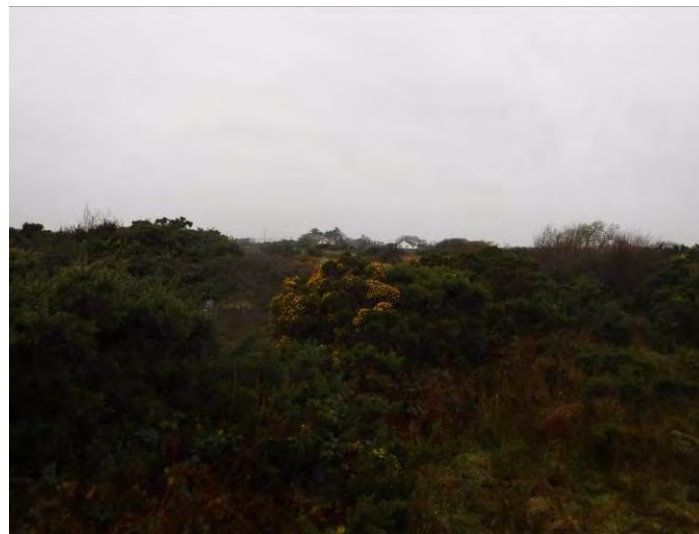
Plate 13.20 - TB 7, facing northeast