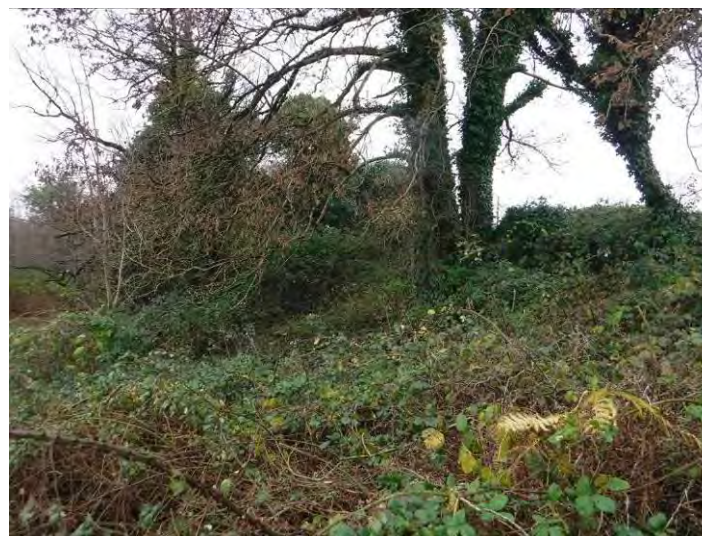
Plate 13.78 - TB 23, facing southwest