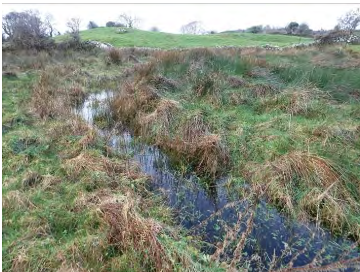
Plate 13.55 - Watercourse traversing area of bog (AAP 7), facing southwest