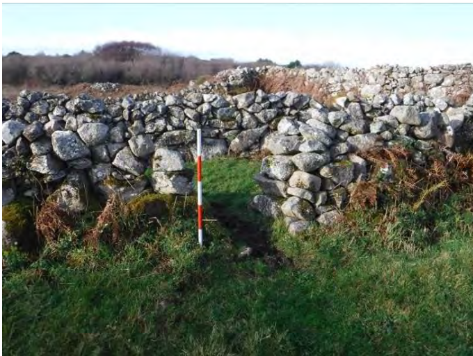
Plate 13.5 – Tradition dry stone granite walling with enclosure entrance, facing west