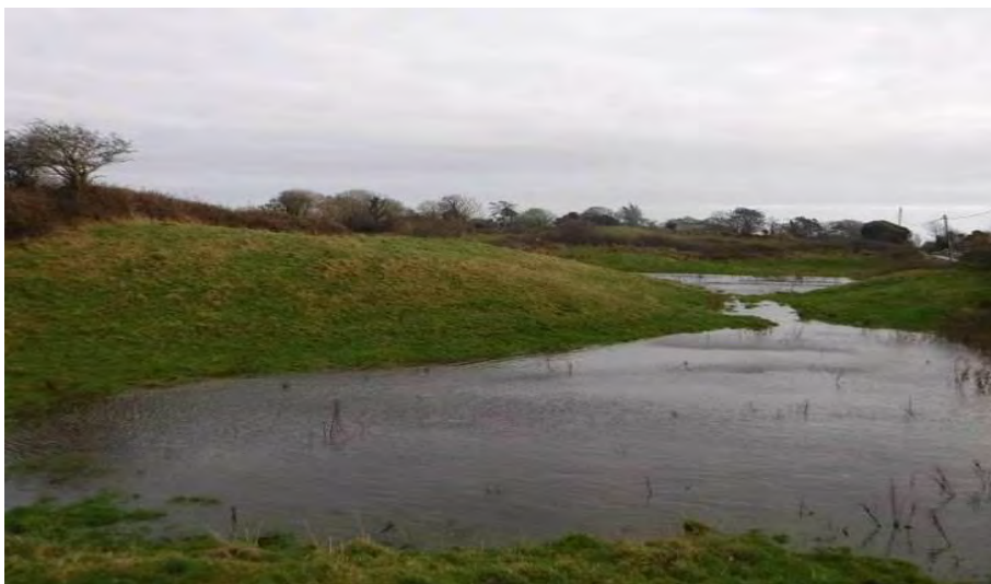
Plate 13.53 - Area of standing water to the east of Letteragh Road, facing southeast